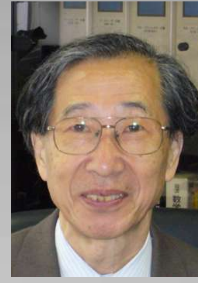
Shun-Ichi Amari 1993