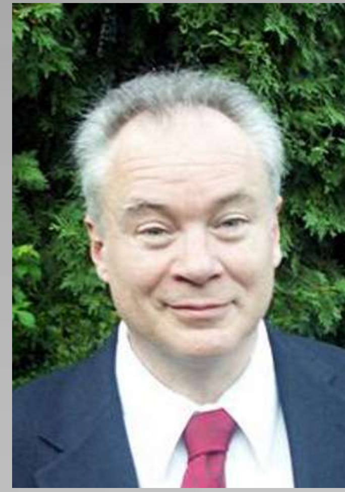
Paul Werbos 1991-1992